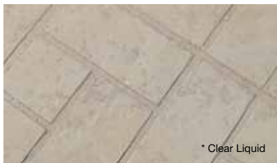
Seamless Stamp with Flander Weave Stencil Colour: Cream Release: Neutral*