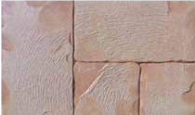
Flemish Cove Finish Colour: Cream Release: Blushing Rose