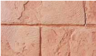
Federation Cove Finish Colour: Apricot Release: Terracotta