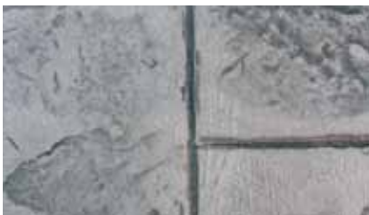
Flagstone Cove Finish Colour: Bluegum Second Colour: Black