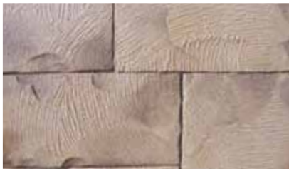
Ashlar Slate Cove Finish Colour: Cream Release: Coffee Brown