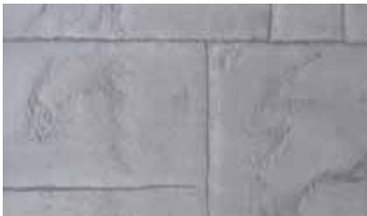
Ashlar Slate Colour: Blue Gum Release: Bluestone