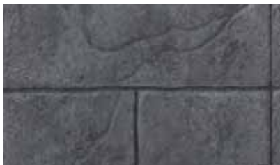
Brindabella Colour: Bluestone Release: Charcoal

Mix and match your choice of base colour with a release agent to achieve a unique finish reflecting your personal style.