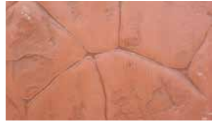
Bushrock Colour: Terracotta Release: Bronze