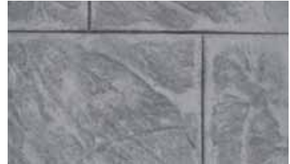
Walkway Slate Colour: Grey Release: Charcoal