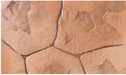
Bushrock Cove Finish Colour: Apricot Release: Bronze