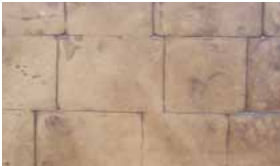
London Cobble Colour: Cream Release: Coffee Brown