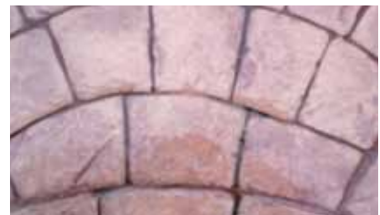
European Fan Colour: Blushing Rose Release: Burgundy