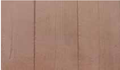
Timber Deck Colour: Bronze Release: Coffee Brown