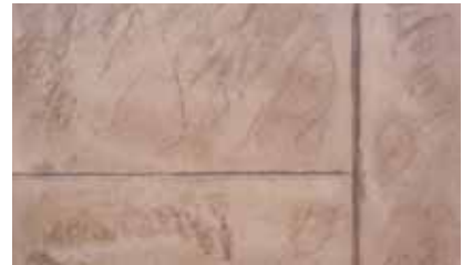
Walkway Slate Colour: Blushing Rose Release: Coffee Brown