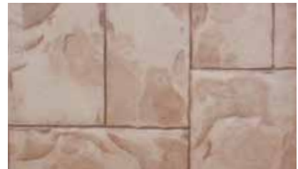
Ashlar Slate Colour: Cream Release: Cinnamon